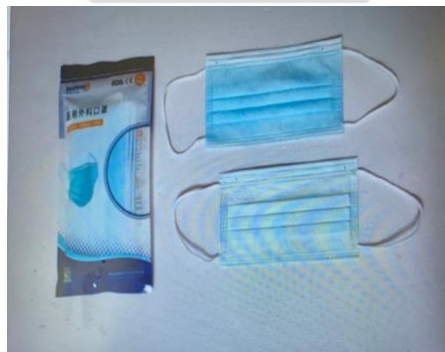
Photo of Samples

Note: Pass = Meet customer requirements; Fail = Fail customer requirements; # = No comment; N.D. = Not detected.